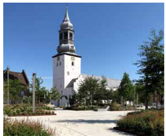
Budolfi Plads, Aalborg