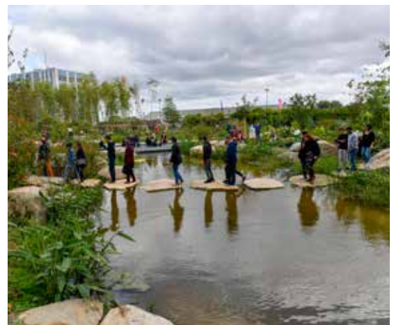
Le Jardin Extraordinaire, Nantes